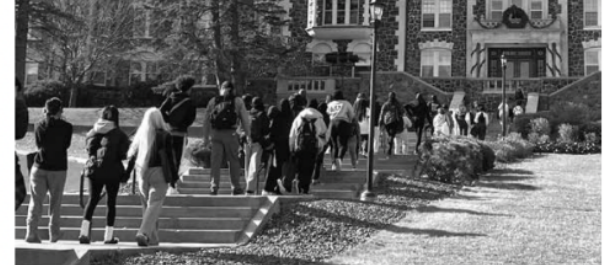
Como Park Hight School students on a "Get Ready" field trip visited the College of St. Scholastica in Duluth on Nov. 1.

To do that, students need to see themselves in college. For many aspiring first-generation college students, these day trips from Como